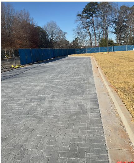
Paver installation completed on the left side.