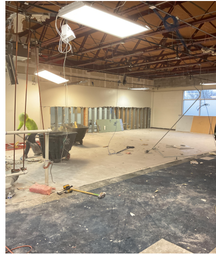
Cafeteria demo in Progress