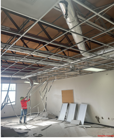
Removing ceiling tile