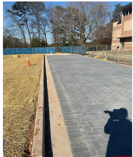
Paver installation completed on the right side.